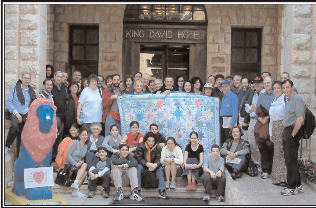
The group in front of the King David Hotel in Jerusalem.