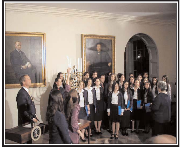
President Bush watching and listening to the Ramaz Chamber Chorus lighting the Menorah and singing Chanukah songs in the White House